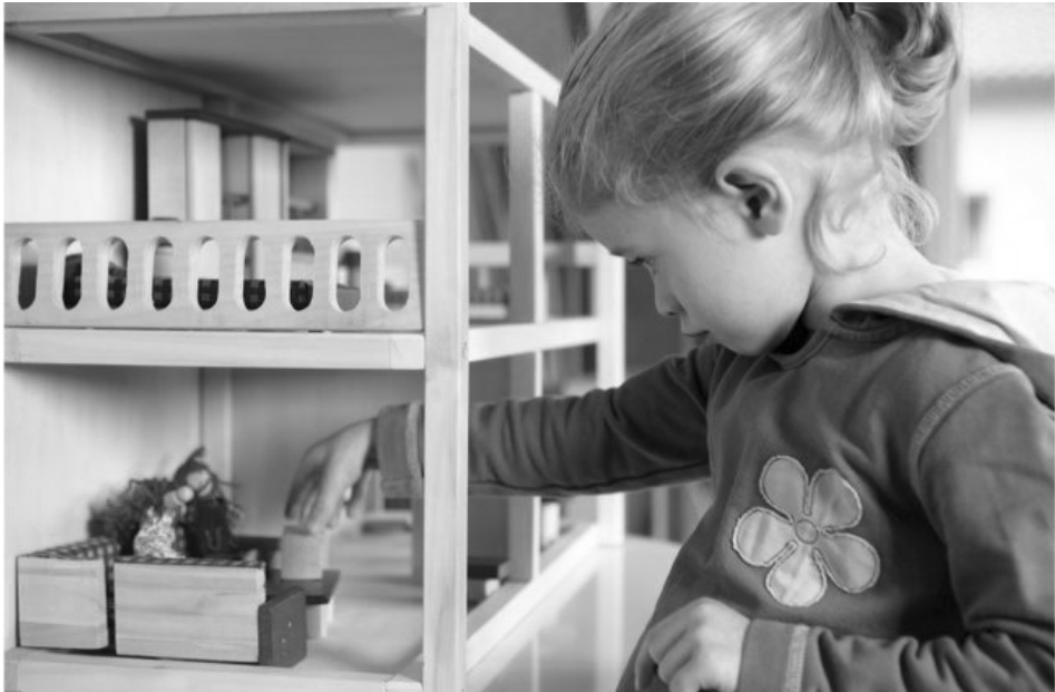
Picture 1: MCAST – doll house used to assess attachment in young children